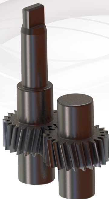
Unique 22-tooth helical pinion set